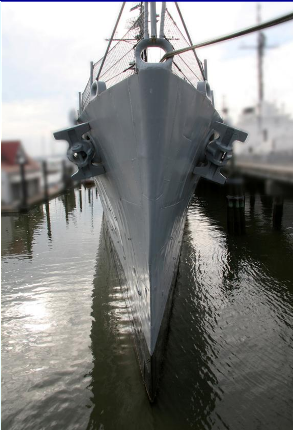
Eye candy: USS Laffey DD-724 at Patriot's Point, SC